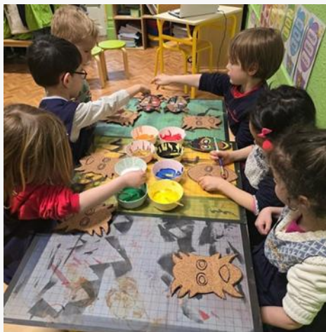
This photo shows students proudly creating their African masks

In our school, art isn't just about painting and drawing — it's a way to explore the world ! This term, our young artists from the Pandas/Koalas 1&2 guided by Maîtresse Ghislaine have been learning about famous art styles from different cultures and countries, discovering how creativity connects us all.